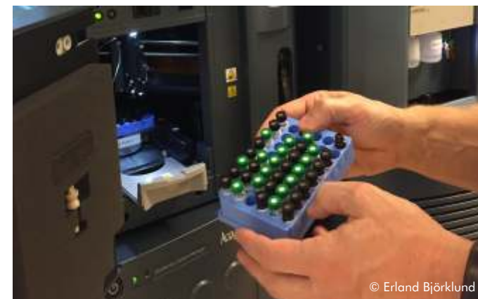
Samples ready to be analysed in LC-MS/MS

The LC and GC separates the analytes before the final analysis and detection in the mass spectrometer (MS/MS).