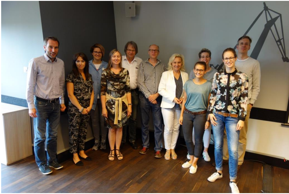
Project Partner Meeting in Gdansk/Poland, June 2018

Should we have sparked your interest in becoming a member of the Baltic Sea Tourism Center, look up the website <u>www.bstc.eu</u> and/or contact the team via <u>info@bstc.eu</u>.