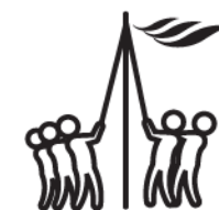
Cooperation capacity building