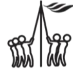
Cooperation capacity building